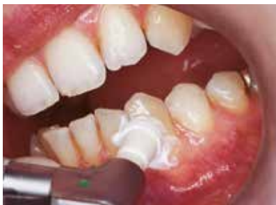
Fluoridation with Bifluorid 10 after a professional cleaning

Bifluorid 10 is the ideal preparation to effectively alleviate these complaints. Bifluorid 10 is ideally suited for accelerated remineralisation and fluoridation of tooth substance. Bifluorid 10 also prevents secondary caries after restoration, especially after employment of the etching technique.