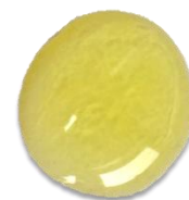
Prime&Bond active™ UNIVERSAL ADHESIVE

Prime&Bond active™ actively mixes with water to achieve a uniform coverage. The excess water then evaporates together with the solvent, leaving a gap-free, homogeneous adhesive layer.