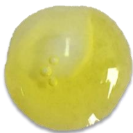
CLEARFIL Universal Bond

While most universal adhesives are rather hydrophobic, Prime&Bond active™ balances hydrophobic and hydrophilic features.